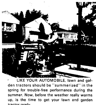
LIKE YOUR AUTOMOBILE, lawn and garden tractors should be "summerized" in the spring for trouble-free performance during the summer. Now, before the weather really warms up, is the time to get your lawn and garden tractor ready.