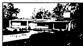
SHARP CONTEMPORARY has deluxe renovated kitchen and 3½ baths. Fireplaces in living and family rooms, library or 5th bedroom. New hardwood floors. Too many extras to mention. Birmingham Schools. $435,000. (644-6300) 194416