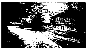
A CLOSE ENCOUNTER WITH NATURE. Woods - Lake - Wildlife. Multi-level home has large slate foyer opens to great room and deck. Library, family room and 1st floor master suite. Lower level maid's quarters. (644-6300) 189868