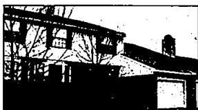
OWNERS HIGHLY MOTIVATED. Beautiful, open, bright 2 bedroom condo with skylights. Lovely family room in finished basement with office and workout room. Enjoy brick courtyard and bay window. 2 bedrooms. $110,900. (851-5500) 194524