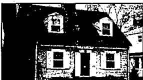
DOWNTOWN BIRMINGHAM, updated Cape Cod with two bedrooms, two baths, a second floor sitting room, library, a living room fireplace, basement, two car garage and central air. Very attractive. $214,900. (644-6300) 194465