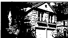
DOWNTOWN BIRMINGHAM TOWNHOUSE has private courtyard entryway, high ceilings, crown moldings, hardwood floors. Gourmet kitchen, three bedrooms, master suite with fireplace. Expansive glass. $419,000. (644-6300) 192318