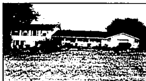
CITY OF BLOOMFIELD HILLS, walk to Cranbrook Schools. Spacious living areas, gourmet kitchen, elegant decor, 20x40 family room with mini-kitchen, library/fourth bedroom, heated garden room. $469,000. (644-6300) 180702