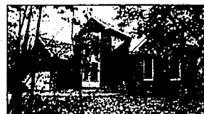
NEW JENSEN BUILT TROY COLONIAL with Bloomfield Hills Schools. 1st floor master with whirlpool bath, 3 family bedrooms upstairs, bay window dining room, library and fireplace. Many custom features. $354,900. (644-6300) 194341