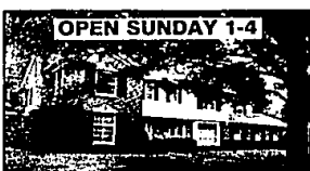
CLASSIC BLOOMFIELD VILLAGE COLONIAL. Custom built with emphasis on quality. Family room, 6 bedrooms 3 fireplaces. Great for entertaining or family living. 1211 Sandringham, S. of Quanton, E. of Lahser. (644-6300) 192315