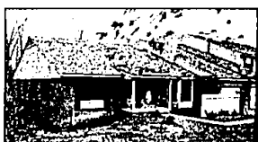
SERENE 2 YEAR OLD end unit at end of court next to woods. Contemporary styling with high vaulted textured ceilings and open floor plan. Many upgrades include kitchen cupboards and bleached oak floors. $139,000. (644-6300) 194628