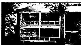
IN-TOWN BIRMINGHAM, corner of Pierce. Cared for condominium. Quiet two bedroom end unit with plenty of parking. Courtyard. Private commons. Around the corner from shopping and near transportation. $69,500. (644-6300) 169776