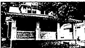
SHARP in-town Birmingham home with contemporary interior and many recent improvements to include kitchen, furnace, air conditioning, water heater, driveway and hardwood floors. Deck. $139,900. (644-6300) 190050