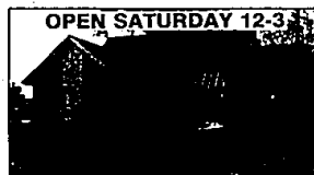
CUSTOM BUILT HOME on prime wooded lot. Over 3,000 sq. ft. of living space. Dramatic cathedral ceiling in living room and master. 2 fireplaces. Neutral carpet. Quality appliances. 3 car attached garage. $274,900. (689-7300) 192333