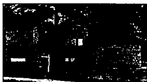
BIG WOODED LOT near Stony Creek Park. 4 bedroom home with 2½ baths, great room fireplace, formal dining room, library/study, 1st floor laundry at the convenience of a 3 car garage. Shelby Twp. $299,000. (651-3500) 097172