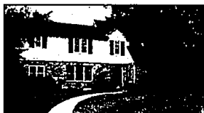
LANDMARK HOME in the City of Birmingham just one block from Quanton School. Beautiful cherry kitchen. Library. Newer family room. Five bedrooms, four fireplaces. Front and rear stairways. $379,000. (644-6300) 189414