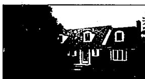
WING LAKE FRONT. Close to shopping and transportation. This charming Cape Cod has first floor bedroom or possible family room, Florida room. Three bedrooms up. Fireplace. Bloomfield Hills Schools. $299,900. (644-6300) 192707