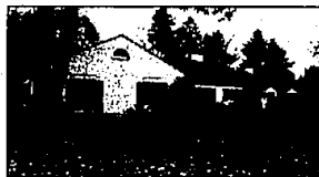
BEAUTIFUL SETTING IN FOXCROFT for this three bedroom, two bath white brick ranch with cedar shake roof. Library and family room. Updated kitchen. Room to expand, if needed. Legitimate charm! $189,900. (644-6300) 194726