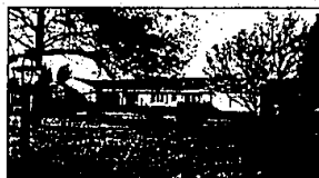
CITY OF BLOOMFIELD HILLS. Across from Cranbrook Schools and gardens. Well maintained ranch on large lot with three bedrooms, 2½ baths, den, Florida room. Marble foyer. Large porch. LOCATION. $398,000. (644-6300) 175593