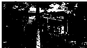
FOREST LAKE CANAL FRONT. Expansive 4 bedroom contemporary on very private cul-de-sac site. Dramatic floor plan features 2-story vaulted ceilings, skylights, fieldstone fireplace and beautiful deck. (644-6300) 192427