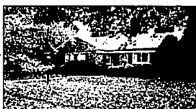
LATHROP VILLAGE RANCH. Great starter home or for empty nesters. Lovely Florida room, game table area with two separate gas heaters. First floor laundry. Hardwood floors. 2 bedrooms. Must see! $87,500. (851-5500) 194169