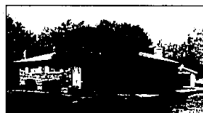
SPACIOUS TROY RANCH. Hardwood floors, fresh paint and newer window treatments. Fireplace and cathedral ceiling in family room. Possible 4th bedroom in basement with half bath. Deck. $105,499 (689-7300) 191681