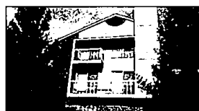
DELIGHTFULLY BRIGHT AND OPEN three bedroom, 3½ bath condo tucked amid greenery of woods and ravine in heart of Bloomfield Hills. Two-story great room, library, finished walk-out lower level. $312,500. (644-6300)