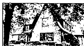
BIRMINGHAM'S POPULAR POPPLETON AREA is the setting for wonderful Tudor with beamed ceiling living room, library, Florida/garden room with views of pool area. 4 bedrooms and 3 baths. Central air. $359,000. (644-6300) 189639