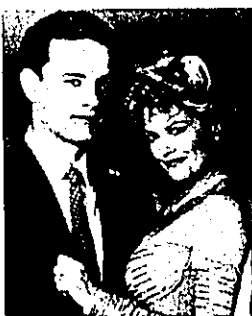
Tom Hanks and Melanie Griffith star in The Bonfire of the Vanities , debuting Saturday on HBO.

Need an excuse to take the day off? How about the fact that every year 10,000 Americans are killed on the job