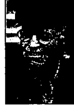
"Loading auto parts into boxcars for Chrysler Corp. back in 1933. It was hot in the summer and cold in the winter." — Lewis Austin Farmington