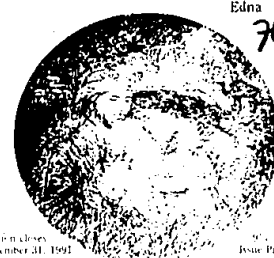
Edna Hibel December 31, 1991

Premiere edition in the new "Edna Hibel Holiday" Collector Plate Series by Edna