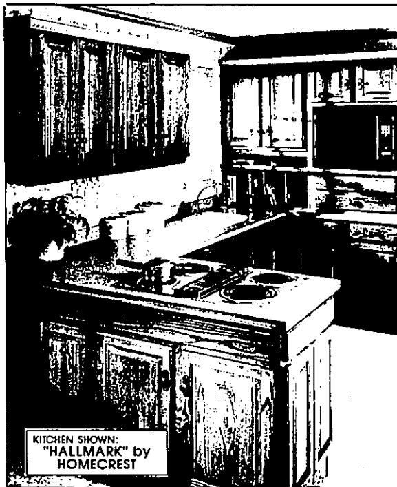
KITCHEN SHOWN: "HALLMARK" by HOMECREST

UP TO 65% OFF Manufacturers List Price On Mid-Continent Cabinets WE DISCOUNT BRAND NAMES SUCH AS: RIVIERA, HOMECREST OR MID-CONTINENT CABINETS EVERYDAY! Discount prices are for comparison only.