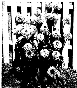
DOUBLE DAISY -- This interesting flower is the new double Gloriosa daisy, easily grown from seeds. It will bloom this summer if you sow them as soon as the soil dries.