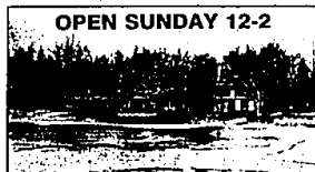
OPEN SUNDAY 12-2

CONTEMPORARY DREAM HOME on enchanting private lake. This 5 bedroom, 4½ bath home is with extras. Exercise room, studio. A gem! 25445 Franklin Park Drive, Franklin, between Franklin Road and Telegraph Road. (644-6300) 195885