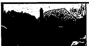
2940 ORCHARD PLACE ORCHARD LAKE FRONTAGE "A Home of Quality"