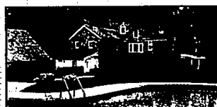
CITY OF BLOOMFIELD HILLS Gracious home with premium location near Bloomfield Hills Country Club. Lovely grounds of over 2 acres with pool, gardens and more. Five to seven bedrooms, 4 1/2 baths, 5 fireplaces. A lovely country estate. $2,750,000 H-192743