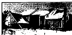
MAGNIFICENT CONTEMPORARY Many amenities such as extensive use of marble, acre-plus lot, 5 bedrooms, 4 full and 2 half baths, 2 large decks, luxury plus rec room, 3 car garage. Mirrored exercise room to keep in shape all year round. $3,775,000 H-196104