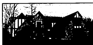
BLOOMFIELD HILLS SCHOOLS Beautifully wooded with lots of tracking to enjoy. Extensive custom features throughout. Four full and 2 half baths, luxury plus rec room, 3 car garage. Mirrored exercise room to keep in shape all year round. $599,500 H-182559