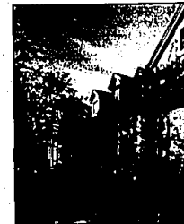
Exterior of a Cranbrook Chase model.

ELIEL SAARINEN'S famed architecture at Cranbrook inspired the Cranbrook Chase conceptual design by the Dallas firm of Riseman Associates Architects Inc. It was the winning firm among five that completed