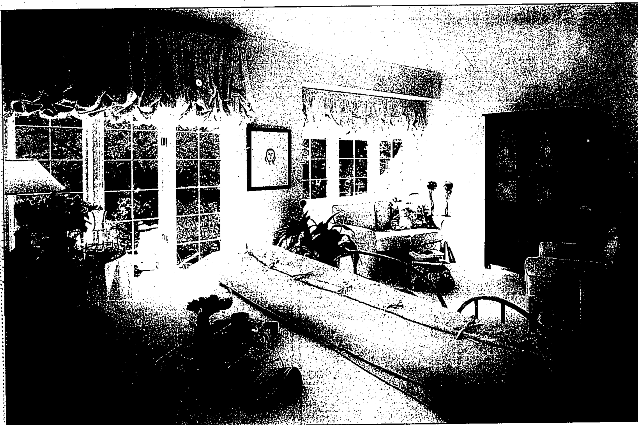
The bedroom invites the outdoors inside.