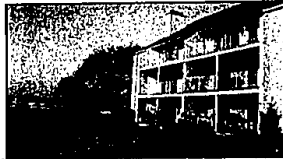
ENJOY THE BEAUTIFUL SUNSETS from this lake-front unit. Large 13'x32' living room with fireplace and studio ceiling. Two doors leading to 23' balcony. Dining room. Two bedrooms and two baths. Basement. $139,000. (644-6300)