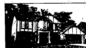
GREAT FAMILY AREA near Marshbank Park for swimming and boating fun. Library, separate dining room, large kitchen, family room with lovely rear yard. Four bedrooms, 2½ baths. Central air. $195,000. (644-6300) 192247