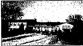
CITY OF BLOOMFIELD HILLS , walk to Cranbrook Schools. Spacious living area, gourmet kitchen, elegant decor, 20x40 family room with mini-kitchen, library/fourth bedroom, heated garden room. $438,500. (644-6300) 180702