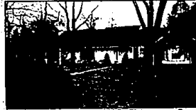
CITY OF BLOOMFIELD HILLS . Picturesque Cape Cod has quality and style. Marble foyer, crown moldings, bay windows, family room with pegged floor and wet bar. Three bedrooms, and three baths. $439,000. (644-6300) 195488