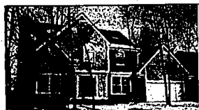
WONDERFUL MISSION SPRINGS at Darb Lake. Traditional home with family in mind. Library, family room with marble fireplace, island kitchen, 4 bedrooms, 2½ baths. First floor laundry. Central air. $269,900. (644-6300)