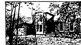
NEW JENSEN BUILT TROY COLONIAL with Bloomfield Hills Schools. First floor master with whirlpool bath, 3 family bedrooms, upstairs, bay window dining room, library and fireplace. Many custom features. $354,900. (644-6300) 194341