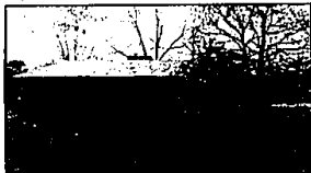
QUALITY BUILT brick ranch on 1 acre in Bloomfield. Three bedrooms, 2½ baths (includes master bath), attached garage, large kitchen, family room, 2 fireplaces, central air. Birmingham Schools. $179,500. (689-7300) 194671