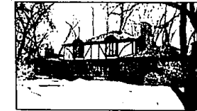
ELEGANT TUDOR in Bloomfield Hills with exquisite architectural detailing. Treed natural landscaping and stone walks. Four bedrooms, 3½ baths. Newly decorated walk-out lower level. Motivated. $499,000. (851-5500) 181274