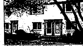
LOVELY BIRMINGHAM TOWNHOUSE with courtyard setting has remodeled kitchen with bleached oak cabinets and bleached floor in living room. Two bedrooms. Finished basement. Convenient location. $73,000. (644-6300) 194192