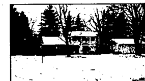
GRACIOUS, ARCHITECT DESIGNED HOME tucked away in a woody setting but very close to Birmingham. First floor master suite, family room, 4 bedrooms, 3½ baths. Glassed porch off living room. $339,000. (644-6300)