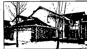
STUNNING TOWNHOUSE with two-story great room, magnificent hardwood flooring thru-out first level. Impressive living room fireplace. Family room. Master with two walk-in closets. Three bedrooms. $285,000. (644-6300) 175059