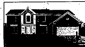
SPACIOUS WESTBRIDGE CLASSIC with contemporary flair. Backs to premium site with picturesque sunset views. Four bedrooms, 2½ baths, dining room, library/study, security system, wet bar. Rochester. $229,900. (651-3500) 097306