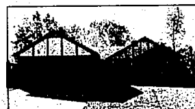
BACKS TO WOODED AREA . Original owner ranch has great room with cathedral ceiling and brick fireplace and hearth. Doorways to deck off master suite and living area. Security system. Central air. $159,000. (689-7300) 193991