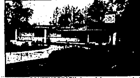
SHARP CONTEMPORARY has deluxe renovated kitchen and 3½ baths. Fireplaces in living and family rooms, library or 5th bedroom. New hardwood floors. Too many extras to mention. Birmingham Schools. $435,000. (644-6300) 194416