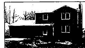
CHARMING HOME on country-sized lot. Custom oak cabinets in gourmet kitchen, central air, first floor laundry, new carpet in living/dining area, attractive windows. Oversized garage/workshop. Rochester. $129,900. (651-3500) 097782