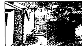
DELIGHTFULLY BRIGHT AND OPEN 3 bedroom, 3½ bath condo tucked amid greenery of woods and ravine in heart of Bloomfield Hills. Two-story great room, library, finished walk-out lower level. $312,500. (644-6300) 195044