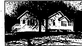
WINTER: IT ALL BEGINS HERE . Country setting minutes from town. Extensive updating in 1990. Shingles, kitchen cabinets and sink, bath and vanity, carpet thru-out and mini blinds. This is a special home. $79,000. (851-5500) 182464