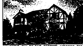
MAJESTIC CUL-DE-SAC SETTING enhances fine craftsmanship in this custom Tudor. Dramatic gallery foyer, library, family room, 2 fireplaces, 5 bedrooms, 3½ baths and a walk-out lower level. WOW! (644-6300) 192741