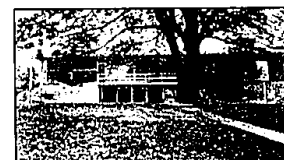
VAN NORMAN LAKEFRONT . Big country kitchen with spectacular lake view. Walk-out patio from family room with bar. Room to grow and expand. Three bedrooms, two baths. Good ice activity on all sports lake. $179,900. (851-5500)