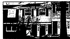
COZY CHARLEVOIX MODEL CONDO has a fireplace in living room between double doorways leading to patio. Dining room. Two bedrooms, 1½ baths. Complex has pool, tennis courts and clubhouse. $85,500. (644-6300)