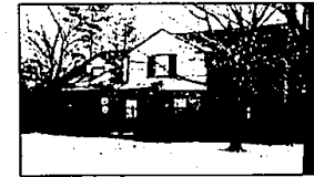
WARM FEELING Bloomfield Village colonial with many leaded glass doors, hardwood floors, library, newer family room and kitchen. Five bedrooms, 2½ baths. Two fireplaces. A charmer in a great location. $369,000. (644-6300)