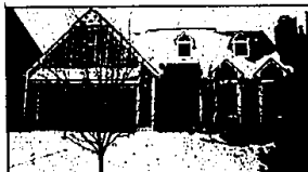
"THE HEATHERS" . Sophisticated detached condo in Bloomfield. Lake view, library with fireplace, vaulted ceiling, bar in great room, three bedrooms. Deck wraps around kitchen, living and dining rooms. $318,000. (644-6300) 196446