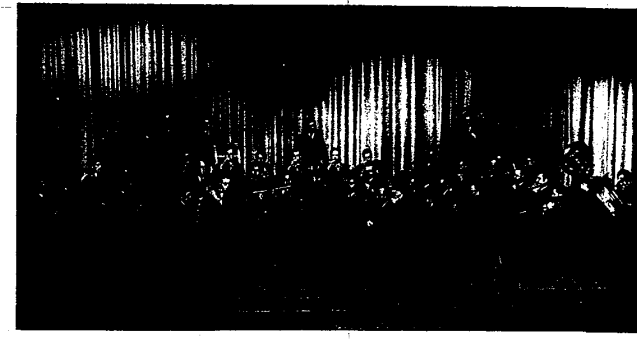
COMING TO FARMINGTON — The Air Force Logistics Command Band, proud holder of an USAF unit citation, will be one of the top attractions among many slated for the Memorial Day Parade in Farmington May 31 beginning at 10 a.m.