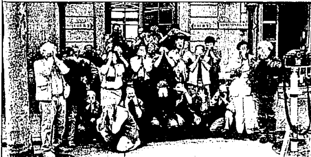
Magnum Annual Meeting, Paris, 1988, as documented by member photographer Elliott Erwitt.