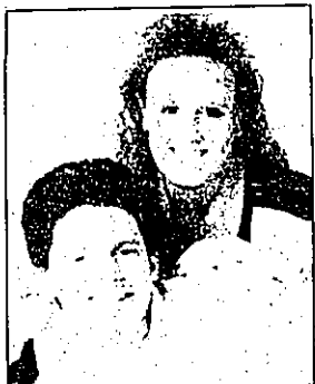
Banquet Hall before leaving on a cruise to the Bahamas and a condo in Florida. They are making their home in Inkster.