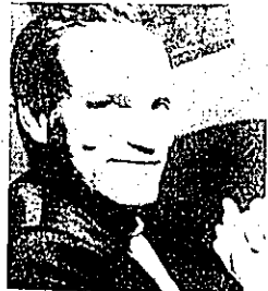
On Friday's Entertainment Tonight , Woody Harrison discusses his film White Man Can't Jump .