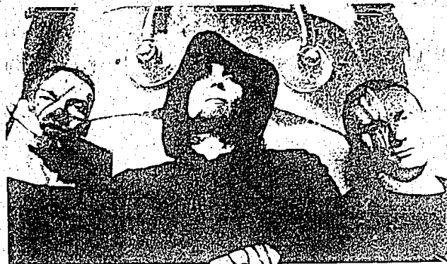
"Tactical Neural Implant" finds Front Line Assembly exploring the more melodic side of techno music.

Those outside projects have had an impact on the material on "Tactical Neural Implant." Undoubtedly, those enamored with Front Line As-