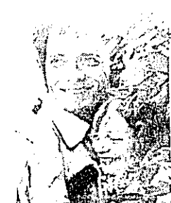
Clint Eastwood, Elizabeth Hartman in The Beguiled