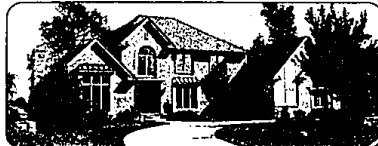
FARMINGTON HILLS. On the pond at Hunters Pointe, this transitional home is ideal for entertaining - great room, family room, formal dining room, and a fantastic kitchen and breakfast area overlooking a picturesque pond. Cathedral ceilings, master suite with balcony, finished walk-out lower level, 3 car garage and circular drive. $489,000 851-8100