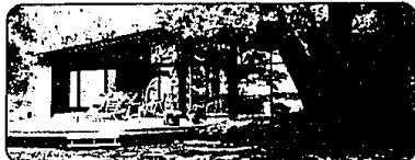
ORCHARD LAKE. Panoramic views of all sports Cass Lake come with this contemporary lakefront Ranch on a wooded lot. Extensively remodeled in 1988. Great room with fireplace. Master bedroom faces lake and has built-ins, full bath and 9x9 walk-in closet. Hot tub in atrium. Security system, central air, air cleaner and more. $539,900 851-8100 06-B-7298