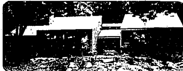
COMMERCE. Spectacular Contemporary features walls of windows, views of Lower Strata Lake, woods and privacy. Fabulous gourmet kitchen. Atrium, waterfalls, great room, library and 2-story foyer. Impressive master suite with 3-sided fireplace. Indulgent master bath features an Italian marble fireplace and much more! $439,000 851-8100 06-B-7381