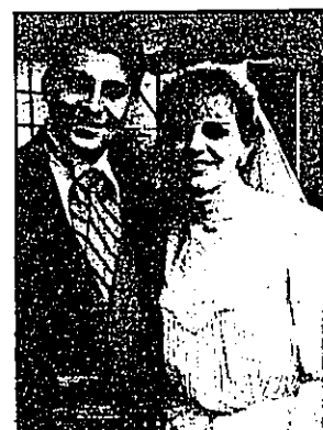
Williamsburg Inn before leaving on a trip to the Yacht Club Resort in Walt Disney World, the couple will reside in Canton.