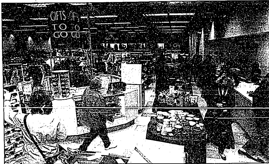
■ "This is really an improvement. I thought that a couple of these stores were going to die. But look at this parking lot. It's nearly full."