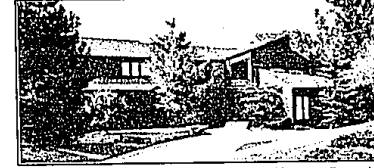
SPACIOUS WADEEK CONTEMPORARY with open floor plan. High-end kitchen with Sub Zero and granite countertops. Great room, 3 car garage. $389,000 B-05168