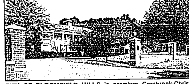
CITY OF BLOOMFIELD HILLS in premium Cranbrook-Christ Church area. Private wooded 1 1/2 acres with stately elevated setting. A fine quality home! $1,350,000 B-04022