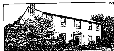
BLOOMFIELD HILLS SCHOOLS with this great family home. Large room sizes, 1991 roof, family room plus den. Move-in condition. $269,000 B-04362