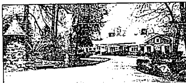
CITY OF BLOOMFIELD HILLS location for this custom ranch on 1.8 acres with river, pond and pool area. Spacious and open with 6,000 square feet living space. $925,000 B-02099