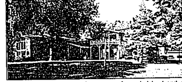
LAKEFRONT ESTATE on four acres of wooded land and all sports lake frontage of 300 feet. Entertainment area with indoor pool! $649,000 B-06202