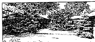
WALNUT LAKE FRONTAGE. Enjoy the privacy of this sprawling ranch with lake views from great room, dining room, family room and master suite. $645,000 B-05394