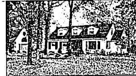
COUNTRY ESTATE in Bingham Farms on almost 3 acres with mature trees. Old-World charm and contemporary comfort blend together in this four bedroom, four bath home with family room, library, studio, sauna. (644-6300) B06889