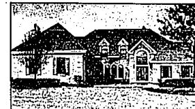
CUSTOM NEW CONSTRUCTION. 2-story foyer with marble flooring, 3 fireplaces, kitchen has Jenn-Aire appliances and walk-in pantry, library, 4 bedrooms, 3 1/2 baths, exercise room with sauna. Rochester. $395,000. (651-3500) 104708