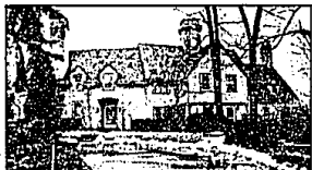
LAKEFRONT ESTATE. Mature trees and perennial gardens surround this authentic Period Estate. Gatehouse at entrance. Winding driveway leads to spacious New England country home on over 3 acres. Nearly 200 ft. frontage. (644-6300)