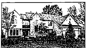
SUPERB TRANSITIONAL STYLING accommodates all tastes. Open, expansive living areas, gourmet kitchen and glorious master suite overlooking tranquil private pond. 4 bedrooms. Finished basement. $399,900. (651-5500) B06208