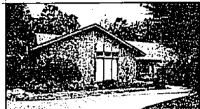
REDUCED OVER $70,000. Beautiful transitional home. Vaulted ceilings and skylights. Totally private lot, master suite on main floor. Finished walk-out lower level. Located in Maple Woods North. West Bloomfield Schools. (651-5500)