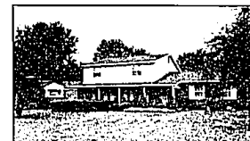
THIS BLOOMFIELD HILLS four bedroom colonial is a surprise! Large family room with fireplace, built-in wet bar, mirrored entertainment center, and get this, a solar room with hot tub, pool and more! $258,500. (644-6300) B05404