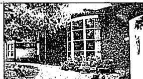
WALLACE FROST CONTEMPORARY with western influence. Vaulted ceilings soar above spacious rooms. Massive fireplaces. Beams, tile and brick floors. 3 bedrooms. Library, porch. City of Bloomfield Hills. (644-6300) B05300