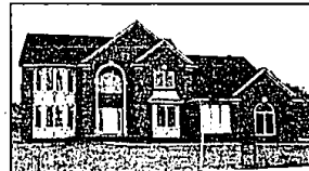
NEW CONSTRUCTION, this Hartford model colonial, built by Olympia Homes, offers library, family room with fireplace and 4 bedrooms. Choose your own colors if you act now. Walk to a Troy Park. $279,000. (644-6300) B04717