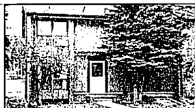
CONVENIENT LOCATION, nice neighborhood for this two bedroom, 1 1/2 bath end unit condominium in need of some TLC. All kitchen appliances included. Patio with gas barbecue. Pool in complex. $59,359. (644-6300) B07725