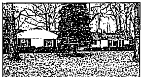
WONDERFUL BLOOMFIELD HILLS RANCH on lovely setting in Hickory Heights. Living and dining rooms have panoramic view. Fireplace, three bedrooms, two baths, Florida room and newer kitchen. $169,900. (644-6300) B07323