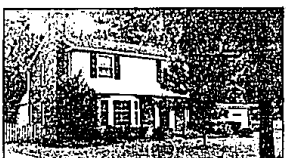
NOT ONLY IS THE LOCATION GREAT but this Birmingham Colonial is most charming. Marble living room fireplace, family room, sun room and three bedrooms. The neighborhood is one to "kill" for! $228,800. (644-6300) B07764