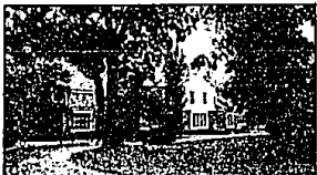
STATELY RESIDENCE on two beautiful acres with rolling gardens, lighted tennis court and large swimming pool near Bloomfield Hills Country Club. Family room, 5 bedrooms, Florida room and 4 car garage. (644-6300) B06825