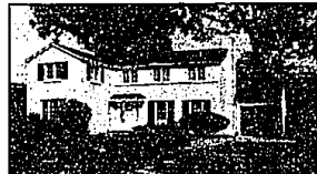
FRENCH COUNTRY COLONIAL in convenient "Front of the Woods" location. Pegged, bleached oak floors, beamed ceilings, 2 fireplaces, galley kitchen and breakfast room. Hugo master suite. Rec room. Den. $169,500. (689-7300) B04391