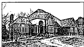
VERY CUSTOM COLONIAL by Guido Grassi has open stairwell to walk-out lower level. Cathedral ceiling in living room, four bedrooms, 3 1/2 baths. Extensive quality upgrades in marble, moldings and systems. (644-6300) B06048