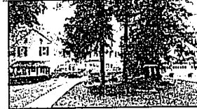
MAJESTIC LANDMARK HOME. Former Skilman Estate has been restored with Integrity! Exquisite detail: moldings, archways, bays, floors and brass hardware. Magnificent kitchen. Unique studio. Carriage house. (644-6300) B06761