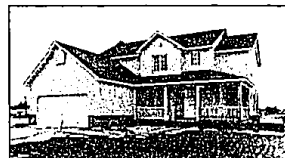
EXCITING NEW CONSTRUCTION in Troy. Customize your new home with list of builder's upgrades or see feature sheets for list of standard items. 4 bedrooms, family room fireplace, 1st floor laundry. $178,900. (689-7300)