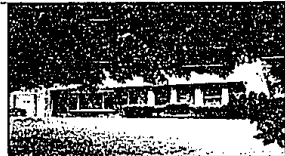
PRIME LOCATION with easy access to freeways, shopping and entertainment. Living room with fireplace. Three bedrooms. Finished basement. Deck. Two car garage. Bloomfield Hills Schools. $129,900. (644-6300) B06820