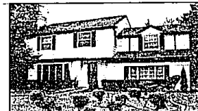
PRESTIGIOUS Bloomfield Village address for this four bedroom colonial. Dramatic interior with family room and library overlooking private rear yard. Updated kitchen with breakfast area. Large sun deck. $275,000. (644-6300) B06737