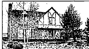
SHARP 3 BEDROOM NOVI COLONIAL on premium site. Tiered deck and brick walkway. Marble foyer, family room, and original 4th bedroom made into master suite. Basement. Central air. $242,000. (644-6300) B07723