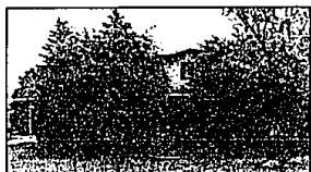
TAKE A BETTER LOOK at this red brick and white aluminum sided colonial home offering formal dining room, living, large kitchen with pantry, family room fireplace. Large fenced lot, deck and pool. $101,000. (651-3500) 102371