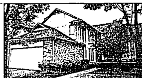
STUNNING TOWNHOUSE with two-story great room, magnificent hardwood flooring throughout 1st level. Impressive living room fireplace. Family room. Master with two walk-in closets. Three bedrooms. $249,900. (644-6300) B75059