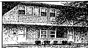
A RARE FIND for all in-town Birmingham condo buyers. Open and bright with 2 bedrooms, all kitchen appliances including washer. Private entry basement. New carpeting and freshly painted interior. $79,500. (644-6300) B99949