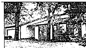
BRIGHT, OPEN AND AIRY three bedroom, two bath contemporary. Dramatic vaulted ceiling in sunken living room. Family room, updated kitchen, neutral decor, and deck. Bloomfield Hills Schools. $139,900. (644-6300) B07765