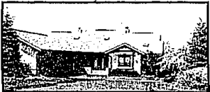
ALL SPORTS LAKEFRONT

With privileges on Gilbert Lake. Quality Contemporary on high wooded lot. Great master bedroom with 2 walk-ins and whirlpool. Cathedral ceiling in living room, dining room, family room. Lots of oak. $695,000