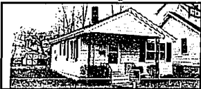
A LOT FOR A LITTLE

Three bedrooms, 2 baths, formal dining, cathedral ceilings, skylights, custom plantation shutters thru-out. Large master bedroom with whirlpool. Partially finished basement. Great landscaping & deck. $245,000