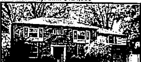
FANTASTIC BIRMINGHAM COLONIAL

Beautifully situated on magnificent site is this 4 bedroom, 2.5 bath family home. Family room, den and 2 car attached garage. Updated kitchen, Bloomfield schools. $239,000