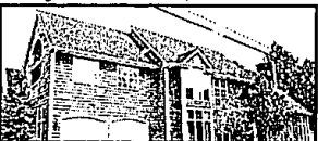
PRIME BIRMINGHAM PROPERTY

Freshly painted 3 bedroom ranch in a wonderful family neighborhood. Library could be 4th bedroom. Living room with bay window and fireplace. New roof shingles, newer furnace, new carpet, extra lot. $89,900