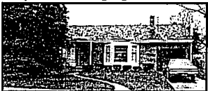
ROYAL OAK RANCH

Ready to move in. Soft contemporary. Bright and open floor plan. Cathedral ceiling, wet bar, fireplace in family room. Great kitchen with large breakfast room. Circular drive, sprinkler system, much more. $325,000