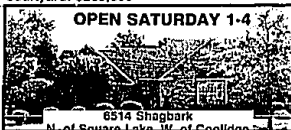
OPEN SATURDAY 1-4

Home with beautiful large landscaped yard with decks and brick patio. All neutral carpeting, hardwood floors, French doors in dining room lead to deck. Central air, newer kitchen. $205,000