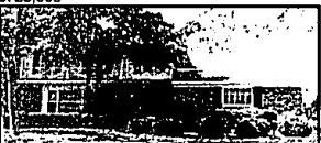
BEAUTIFULLY CARED FOR

At the end of a cul-de-sac with complete privacy. Completely remodeled kitchen with new appliances. New recessed lighting thru-out. Two bedrooms, 2 baths, laundry area off kitchen. $264,500