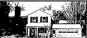
GREAT FAMILY HOME

Sharp 2 bedroom ranch on spacious fenced lot with large family room. Eating space in kitchen and totally renovated bath. Decorated in neutral colors, freshly painted interior. Now vinyl trim. $124,900