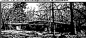
CLIFFORD WRIGHT CONTEMPORARY

Three bedrooms, 2.5 baths, hardwood floors, living room with fireplace. Dining room opens to Florida room. Family room with raised beamed ceiling. Rec room with storage room. $205,000