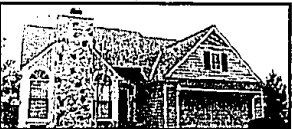
STUNNING HEATHERS CONDO

Walk to Quanton School. New kitchen with eating space, 2 fireplaces, wet bar in family room. Hardwood floors thru-out, new roof, new window treatments, finished basement. In move-in condition. $389,000