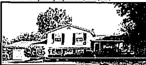
FRESH AND BRIGHT

Great starter home or investment property or retiree home. Three bedroom ranch in nice family neighborhood. Close to shopping and conveniences. $71,500