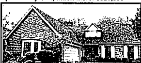
PICTURE PERFECT CAPE

Move-in condition with neutral decor, updated kitchen and bath. Newer kitchen floor & appliances. Master bedroom with 1/2 bath. Beautiful rec room with woodburning stove. Large lot, quiet neighborhood. $88,500