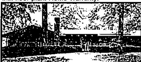
PRIVATE LAKE VIEW

Move right into this 2 bedroom, 1 1/2 bath, Ranch unit. Kitchen appliances included. Bay window in living room. Conveniently located close to shopping and expressways. Doorwall to side yard. $99,000