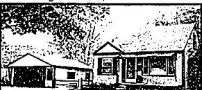
NORTH ROYAL OAK

New England influenced three bedrooms, 2 1/2 baths. Two natural fireplaces. All within easy walking distance to downtown shopping. $549,500