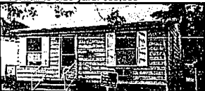
NICE STARTER HOME

Nice, clean and freshly painted three bedroom ranch in popular Pembroke Manor. Hardwood floors, thru-out, except kitchen and bath. New ceramic floor in bathroom. Birmingham schools. $124,900