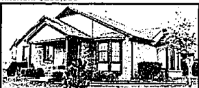
MINT CONDITION CONDO

Large kitchen with eating space and new flooring. Lovely bay window with natural wood seat. Updated bath, three bedrooms, basement partially tiled. Clean, well maintained with neutral decor. $84,900