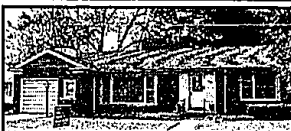
IN-TOWN CONDO ALTERNATIVE

A rare opportunity to own one of the finest properties in the City of Bloomfield Hills. Old world craftsmanship, new world technology merge to produce a masterpiece. Wonderful home for comfortable living.