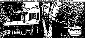
COLONIAL IN MIDVALE AREA

A rare opportunity to own one of the premium homes in Bloomfield Village. Five bedrooms, pool, mature landscaping, elegant detail with a premium location. $725,000