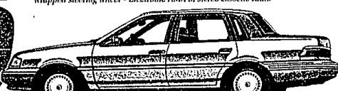
1993 MERCURY TOPAZ GS

COUGAR STANDARD FEATURES: 3.0-liter V-6 engine • Automatic overdrive transmission • Power rack-and-pinion steering • Air conditioner • Power windows • Dual power outside mirrors PREFERRED EQUIPMENT PACKAGE 260A: Fingerprint speed control • Power lock group • Electric rear window defroster • 6-way power driver's seat • Cast aluminum wheels • Leather-wrapped steering wheel • Electronic AM/FM stereo cassette radio