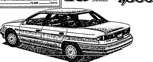
1993 MERCURY SABLE GS

at $1,856 down $269 OR at $926 down With One Advance Lease Payment Or $7,386