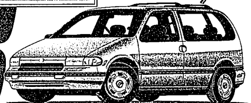
1993 MERCURY VILLAGER GS MINIVAN

at $1,644 down $299 OR at $1,003 down With One Advance Lease Payment Or $7,817