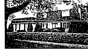
GREAT LATHRUP VILLAGE LOCATION. Four bedrooms, 2 1/2 baths, both family room and library. Central air. Security system. Large lot with an Inground pool. Owner transferred. Not a drive-by. $159,900. (644-6300)