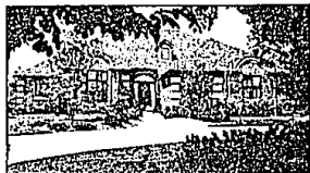
BLOOMFIELD HILLS SCHOOLS. Fireplaces in living and family rooms, library, 3-5 bedrooms, professionally finished lower level with fireplace and built-ins. Hardwood floors. Deck. Impressive elevation. $499,900. (644-6300) B14553