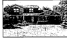
FAMILY HOME on well maintained corner lot with nice trees and perennials. 1st floor laundry, large family room with wet bar and fireplace. 3 bedrooms, 2 1/2 baths, formal dining room. Central air. Rochester. $166,900. (651-3500) 108121