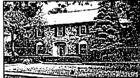
OLDE BIRMINGHAM. Updated classic Georgian colonial has a large family room with second kitchen. Five bedrooms including spacious master suite, 3 1/2 baths, three fireplaces. Enclosed porch off living room. $490,000. (644-6300)