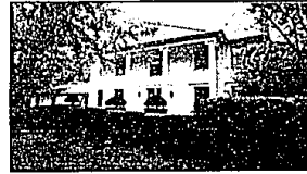
WHERE'S SCARLET O'HARA? Large trees frame this Southern Colonial with library, family room, four bedrooms, three baths. Lovely grounds and pool. Close to nationally acclaimed Bloomfield Schools. $443,900. (644-6300) B14625