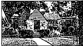
CHARMING BUNGALOW in the Shina area! Living room fireplace, formal dining room, three bedrooms, two baths, basement with recreation room, office and wine cellar. Large deck. Move right in! $132,500. (644-6300)