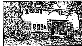
CONVENIENT ROYAL OAK LOCATION. Colonial with den or fourth bedroom on first floor, living room fireplace, large breakfast area. Two baths. Hardwood floors. Newer furnace and central air. $137,900. (644-6300)