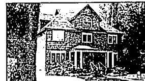
SUPERIOR DESIGN and craftsmanship with soaring ceilings, center island Euro-style kitchen, family room, dramatic 2-story master suite, 3rd floor office or studio. Short walk to downtown. Birmingham. $499,000. (644-6300) B14628