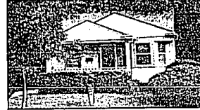
CHARMING BIRMINGHAM BUNGALOW is clean, freshly painted and ready for the new owners. Two bedrooms, hardwood floors, basement and garage. Patio with BBQ grill. Close to downtown shopping. $89,900. (644-6300) B14116