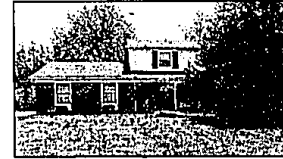
BEAUTIFUL LOT! Almost an acre of large trees, woods and nicely landscaped lawn. 4 bedroom home with some hardwood floors, formal dining room, family room fireplace. Immediate possession. Oakland. $164,900. (851-5500)