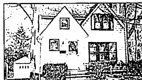
IN-TOWN BIRMINGHAM COLONIAL ripe with potential. Library overlooks the large deck. Separate breakfast room. Three bedrooms, 1 1/2 baths. Leaded glass windows. A real charmer in a great location. $184,000. (644-6300) B11544