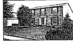
STYLISH COLONIAL in popular Troy. Bay window in dining room, cathedral ceiling in family room. Crown moldings and hardwood floors. Large deck, brick patio, rail fence and pine trees in rear. $239,900. (644-6300)