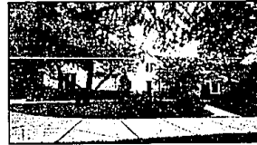
LIGHT AND BRIGHT COLONIAL with mature landscaping and a looped drive. This beautifully designed home is open and spacious. Extensive use of glass and hardwood floor. Bloomfield Hills Schools. $459,000. (644-6300) B13197