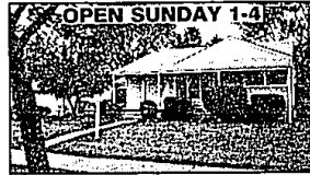
OPEN SUNDAY 1-4 COZY RANCH on a double lot. Lower sliding and windows. Finished basement with office or 3rd bedroom. Enclosed breezeway. Extra garage for workshop. 3903 Greenway, R.O., N. of 13 Mile, E. of Coolidge. (851-5500) B14124