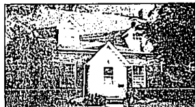
APPEALING 2-STORY with cove ceilings, hardwood floors, 6-panel doors, a fireplace in the living room, 4 bedrooms, 1 1/2 baths, sun room and recreation room. Private rear yard with patio. Central air. $124,900. (644-6300) B14543