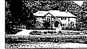
BEAUTIFULLY LANDSCAPED Bloomfield Hills site overlooking a tranquil pond. Four bedroom, 4 1/2 bath colonial with marble two-story foyer, library, family room, Euro-style kitchen, central air and much more. (644-6300) B09529