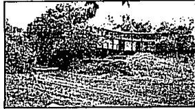
ALBERT KHAN DESIGNED , complete with high ceilings, recessed track lights and skylights. Terrazzo floors. Lower level feels like a main level with doorwall and large garden windows. 4 bedrooms. 2 1/2 car garage. $304,900. (851-5500)