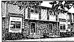
NEW NORTH ROYAL OAK TOWNHOUSE with all the amenities including oak floors in living room, dining room and kitchen. Two bedrooms, 1 1/2 baths. Basement. Central air. Security system. Lovely deck. $82,500. (644-6300) B13133