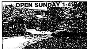
OPEN SUNDAY 1-4 CUSTOM BUILT COLONIAL. 1st floor master has door to deck and pool. 3 bedrooms up, 4 baths. Screened porch. 2 fireplaces. Security system. Pella windows. $199,700. 3927 Elizabeth, Troy, S. of Wauhatchie, W. of Livermore. (689-7300)