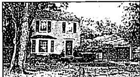
BEVERLY HILLS COLONIAL situated on nearly two beautifully landscaped fenced lots. Fireplaces in living and family rooms, three bedrooms, two baths. Recently updated. Central air. Deck and patio. $179,000. (644-6300)