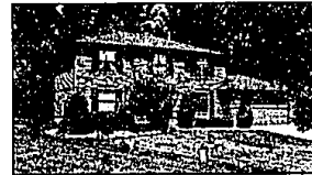
$2,000 DECORATING ALLOWANCE. Treed lot at the end of a quiet cul-de-sac setting. Open floor plan. Ceramic tiled foyer. Oak kitchen cabinets. Marble sills. rear surrounded by large trees. $189,900. (851-5500) B14189