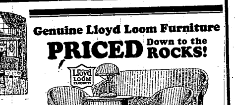
Genuine Lloyd Loom Furniture PRICED Down to the ROCKS!

The finest made trunks—Travelling Bags, Suit Cases, Hat Boxes, Genuine Leather Gladstone Bags at a Price Never Heard of before—Take a Sampson on your Vacation