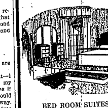
BED ROOM SUITES Bed, Dresser, Chiffoniere Walnut—Finely Made $80.00—$82.50—$130.00