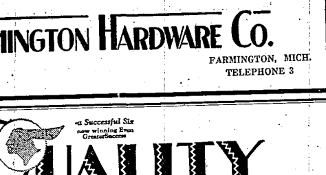
Pontiac Six has long served as an outstanding example of quality—of materials, of design and of workmanship.

QUALITY that is winning new thousands every week