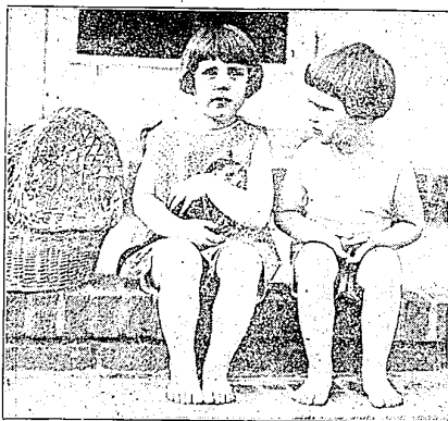
Children Playing in Their Sun Suits.