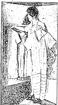
Making the Closet Orderly.

(Prepared by the United States Department of Agriculture.) The girl in the illustration is a member of one of the 4-H clubs in room improvement directed by the United States Department of Agriculture and the various agricultural colleges. She has made certain changes in her room at the suggestion of the club agent, including the rearrangement of her clothes closet. Freshly painted woodwork and furniture, a rearranged floor, and new covers for her bed and other pieces of furniture were also a part of the improvement she effected. In the closet, which she wanted to make orderly and attractive, she put a lengthwise pole made of an old broomstick, and provided as many clothes hangers as she needed, to economize space and keep her garments fresh and unwarmed. Having the closet arranged so that it was just as easy to put things away