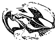
Eagle hand cooler. 150.00.