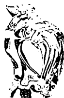
Rooster hand cooler. 150.00.