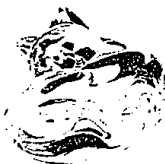
Car hand cooler. 150.00.