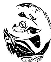
Owl hand cooler. 150.00.

As the quintessential American glassmaker, Steuben is renowned for full lead crystal of exceptional brilliance and artistic vision.