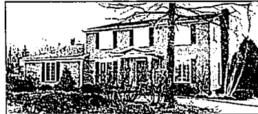
BLOOMFIELD VILLAGE. Spacious 5 bedroom family home! Excellent floor plan, gourmet island kitchen, lovely sun porch, too. Fine premium location. $499,500 B-17418