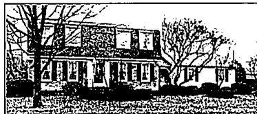
HICKORY HEIGHTS. Charming is the word for this meticulously maintained family home. Newer kitchen, sprinkler system, central air and more! $309,900 B-14899