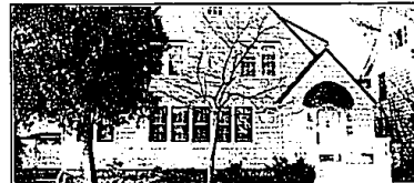
WALLACE FROST CHARMER. Completely updated with beautiful interior. Five bedrooms, five and a half bathrooms, 3 fireplaces, delightful summer porch. $499,000 B-16680