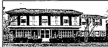
FRANKLIN. Architect's own contemporary in a beautiful private setting. Open floor plan with lots of marble, glass and wood! Five bedrooms. $749,900 B-17485