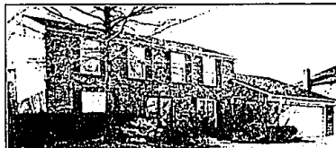
GREAT FAMILY HOME. Charming colonial with circular stairway, family room with wet bar, formal dining room, beautiful inground pool. Premium area! $234,500 B-16395