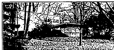
COMPLETELY UPDATED. Outstanding contemporary! Versatile use of area, family room plus library, high ceilings, skylites, white kitchen! $189,900 B-16625