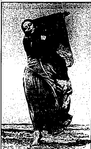
Graceful image: Clothing drapes itself around the dancer's body in this Himmelfrich photo. The cloth in many of the photos seems natural, making the dancers look like flowers or birds.

Himmelfrich photographed indoors as well. His studio shots are poetic and balanced too. A woman's arms, the fingers linked, make a graceful diagonal line across one photo.