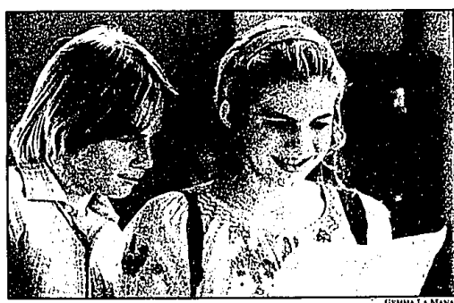
Journey: Nick (Austin O'Brien) and Vada (Anna Chlumsky) share a discovery in their search for the truth about Vada's mother, in "My Girl 2," a Columbia Pictures Release.