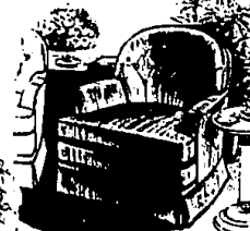
Our most popular low profile swivel rocker features a curved button tuft back and flared arms. $399