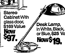
Stereo Cabinet With glass door, $169 Value Now $97.

Set Of 3 Open Bookcases, in White, $267 Value Three For Only $99.