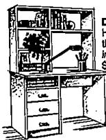
Desk, With Hutch and three Drawers, in White, $163 Value Now $109.

Starter House is the smart place to start. Sale prices good through February 27.