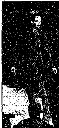
Chloe creation: Lagerfeld-designed mid-thigh grey wool jersey dress is paired with orange tights and matching high-heeled suede boots.