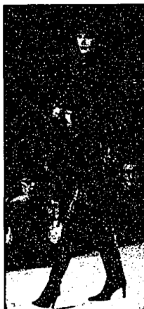
Valentino style: Paisley-printed tights and long scarf accent black short-skirt suit with long jacket.