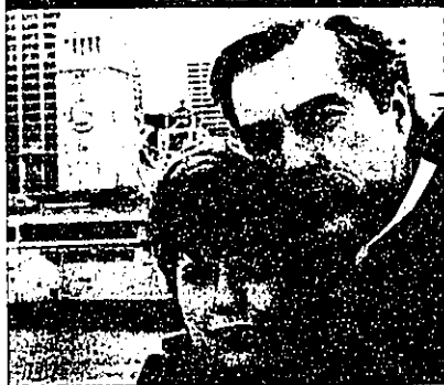
Pam Dawber and Powers Boothe star in "Web of Deception," a thriller premiering Monday on HBO, about a forensic psychiatrist who's drawn into a dangerous plot after rejecting an obsessed woman's advances.