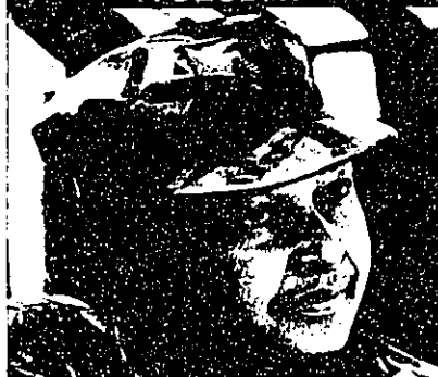
PBS' "Frontline" looks at the political comeback of Winnie Mandela, the estranged wife of South African activist Nelson Mandela, on Tuesday (check local listings).