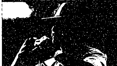
James Brown travels "To the Ends of the Earth" via the USA Network. The adventure special, premiering Wednesday, features the actor exploring the wilderness of Kenya.