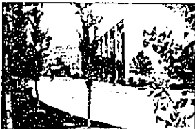
Somerset Mall Collection

Troy describes itself as "The City of Tomorrow...Today." Troy is indeed a relatively young, modern, well-planned city of more than 76,000 residents and of more than 93,000 jobs for people to work here each day.