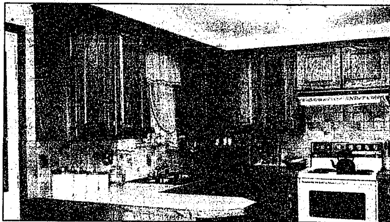
Spiffing up: Refacing existing cabinets, a new countertop and new splashblock (below) can give a kitchen a fresh, new appearance (left).