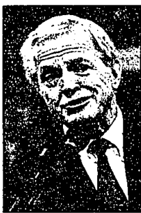
U.S. Rep. Joe Knollenberg

In 1992, Knollenberg had his campaign office in the same shopping center at 12 Mile and Orchard Lake. Members of Congress must face election every two years.