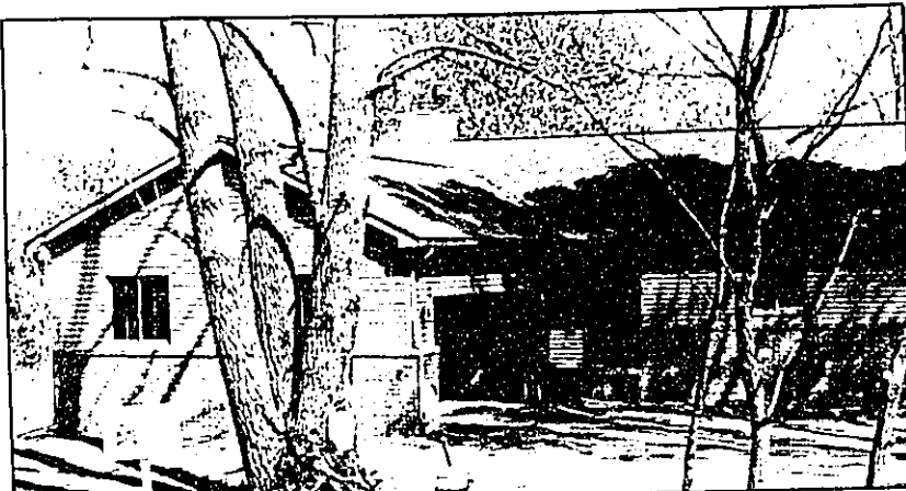
This Pinckney home, number twenty-three, is located in Old Mill Hills.

25. Pinckney, 2888 Dana Pointe Drive. A Moon Shadows home, this $249,900 model was built by Unique Style Home Builders and features 2,400 square feet with a Victorian design.