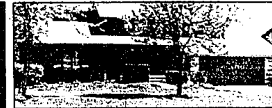
NATURE LOVER'S DELIGHT!

5 bedrooms & 2 1/2 baths with lots and lots of charm! New furnace, new roof, deck, fenced-in yard/Directly across from Power Park. Close to schools, shopping and expressways. LOTS OF ROOM!! $279,000 855-2200 POW