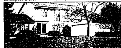
TREAT YOURSELF TO THE ULTIMATE!

Terrific detached townhouse condo professionally decorated in neutrals. 3 bedrooms, 2 1/2 baths, gigantic great room with marble foyer & fireplace. Fabulous master suite, library with custom built-in wall unit. Priced to sell at $339,900. 626-8700 400162FAI