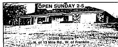
OPEN SUNDAY 2-5

Prime location! On over an acre. This home has been updated with bleached hardwood floors, ceramic tile, recessed lighting, 5 bedrooms, 3 1/2 baths, screened porch, cathedral ceilings, built-ins. $399,000 626-8700 417038SUS