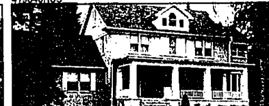
BEAUTIFUL CHARMING PILLARED COLONIAL!

STUNNING CONTEMPORARY FOR THE RICH & FAMOUS!! 1989 executives delight overlooking all sports lake! 4,800 sq. ft., 5 bedrooms & 4 1/2 baths. Finished walk-out lower level, 1st floor master, marble thru-out, 3 + car garage. EVERY FEATURE YOU DREAMED OF! $590,000 855-2200 LOC