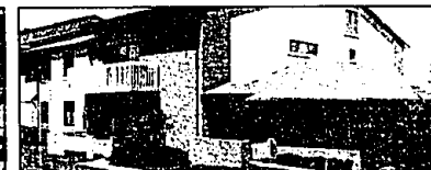
BETTER THAN NEW!

3 bedroom contemporary ranch home is priced well below market appraisal. On a canal leading to Sylvan Lake with 20 ft. dock. New kitchen with top-of-the-line appliances, 2 updated baths. West Bloomfield schools. $199,900 626-8700 419840RUS