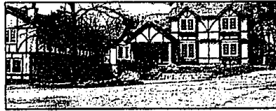
ENJOY THE AMBIANCE

Of grounds surround this fabulous first floor master suite contemporary home in North Wabek. White ceramic tile, soaring ceilings, great room with wet bar, library, plus 4 bedrooms up with loft family room, front to back custom kitchen, plus! $825,000 626-8700 427042WAB