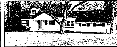
HEART OF FRANKLIN VILLAGE

Custom traditional home has the look of the 90's. 4 bedrooms, 2 1/2 baths, family room with fireplace plus finished basement. Too many amenities to mention. This home must be seen. $314,900. 626-8700 417851RAM