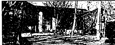
BLOOMFIELD HILLS SCHOOLS

Warm and inviting contemporary with hardwood floors and soaring ceilings. Plaster fireplace, library with floor to ceiling built-ins. Private master suite, 3 large additional bedrooms each with access to a bath. $599,000 626-8700 B10031SEV