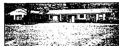
PRESTIGIOUS SODON LAKE AREA

Beautifully redone Cape Cod. Gorgeous country kitchen with formica cabinets, hardwood floors thruout, 4 bedrooms, 2 baths, pool and dream lot, Birmingham schools. Great buy at $235,000! 626-8700 B08100ROM