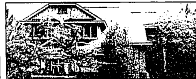
WOODCLIFF ON THE PARK CLUSTER

Updated colonial with contemporary flair. Bleached maple Woodmode kitchen, white formica baths, marble entrance, oak & lucite rail. Desert-alra climate control in pool room, sauna, multi-level decks. $389,900 626-8700 406405WIN