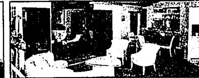
KNOCKOUT CONTEMPORARY RANCH CONDO

"BEST IN CLASS" CONTEMPORARY IN SHORES OF BAY POINTE! X-tra large rooms. Excellent entertaining home; expanded great room leading to open kitchen & breakfast area. 3 bedrooms & 2 1/2 baths. EXCELLENT LOCATION & PRICE! 1st SHOW WILL BE A BUY! $211,000 855-2200 HEA