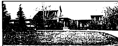
CONTEMPORARY WITH STYLE

Of this Clarkston lakefront estate situated on 21.5 acres with private setting, nicely treed property on a quiet road. Connected guesthouse, over the garage, fenced 4 stall horse barn, much more! $698,000 626-8700 406539RID