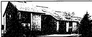
OVER AN ACRE

3 1/2 acre estate in Rochester Hills. This brick & slate Tudor boasts 2 kitchens on the main floor, limestone family room, paneled library, carved fireplaces, 4,000 sq. ft. guesthouse overlooking Stony Creek. $1,395,000 626-8700 417161MIL