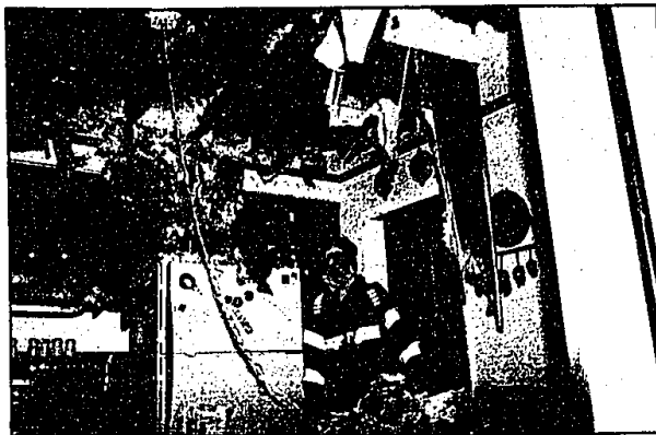
Hills fire: Farmington Hills firefighters — including Kevin Burshe (above) — extinguished a fire in a house on Aranel Street June 1. Firefighters said the fire started in the attic, the result of an electrical problem. No injuries were reported.