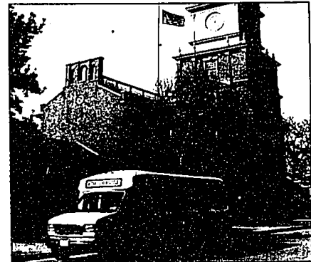
All aboard! Shoppers can hitch a ride on the new Attractions Shuttle from Fairlane Town Center, arriving at Greenfield Village, Henry Ford Museum, Henry Ford Estate, Detroit Historical Museum, Greektown and the Renaissance Center in style.

Tel-Twelve Mall is home to Kmart's, Crowley's, Montgomery Ward, The Gap Warehouse, Winkelman's Superstore, MC Sporting Goods, Office Depot and more than 70 specialty shops, restaurants and services.