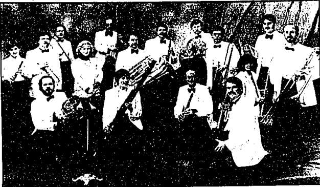
Ensemble: Celebrating its 50th anniversary season, Detroit Chamber Winds is an ensemble of professional musicians committed to bringing to life the large and wonderful body of mixed wind and brass music that utilizes between six and 20 musicians. They will be performing at the Great Lakes Chamber Music Festival, June 11-18.