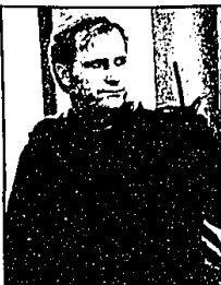
Partner: Michigander Jeff Daniels stars as Harry Temple, Jack's partner in "Speed."

The bomb-laden city bus was actually 10 identical vehicles each outfitted with different driving, camera and lighting rigs. For in-