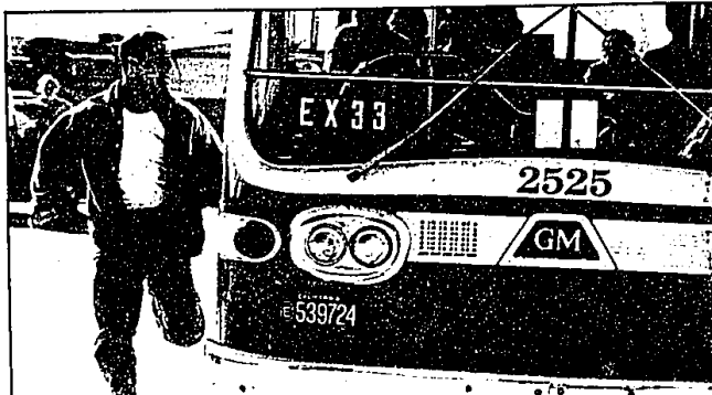
Thriller: Keanu Reeves is Jack Traven in "Speed" a thriller about a cop who must remove a bomb planted beneath a bus that is set to explode when the speed of the bus drops below 60 miles per hour.

In battling Payne, Reeves is assisted by two noted stage and screen actors, Obie Award win-