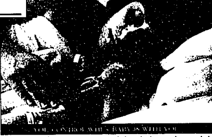
YOU CONTROL WHEN YOUR BABY IS WITH YOU.