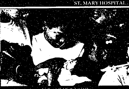
YOU CONTROL WHEN YOU WANT HELP.

hours a day is fine. Less often if you wish. We bring services to you, so your baby only goes to the nursery when you decide. To control what you need to learn. Our nurses can teach you everything from giving