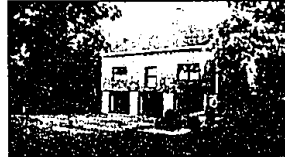
AUTHENTIC CARRIAGE BARN now a fascinating home. Three bedrooms plus a pullman guest bedroom. Cherry cabinetry. Study alcove, children's play loft and stunning 36' stone room. Plank floors. $325,000 (644-6300) 421815