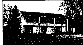
BLOOMFIELD VILLAGE four bedroom, 2 1/2 bath colonial has family room with fireplace, gorgeous light oak kitchen with 18x17 garden room, wrought iron enclosed in-ground pool, and much, much more. $476,900 (644-6300) 816710