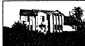
BLOOMFIELD CROSSING AT ITS BEST. Great family home, good location in subdivision. Family room with fireplace, library, finished lower level with full bath and 2nd bedroom suite. Deck. $474,800 (644-6300) 423998