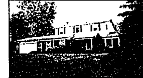
MOVE RIGHT IN and start enjoying this updated and freshly decorated colonial. Open floor plan with generous storage. Enjoy the privacy of a park-like backyard. Spacious oversized garage. Hurry, won't last! $186,900 (851-5500)