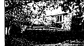
BEAUTIFULLY APPOINTED Bloomfield Hills Robertson townhouse. Lovely courtyard entrance. Three bedrooms, 2 1/2 baths, 3 fireplaces, walk-out lower level. Spectacular views from 3 levels. Gated community. $339,900 (644-6300) 815993