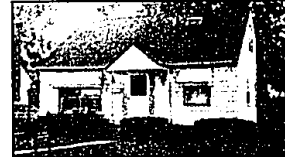
GREAT IN-TOWN BIRMINGHAM THREE BEDROOM bungalow with many amenities. Hardwood floors, updated kitchen. Master suite with full bath, walk-in closet and skylights. Basement. Garage. $122,900 (644-6300) 429269