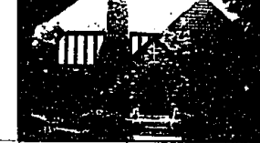
AUTHENTIC 1928 ENGLISH TUDOR with all the charm you would expect. Four bedrooms, library, hardwood floors, plaster moldings, beautiful wood stairway. Lovely patio and perennial gardens. $179,000 (644-6300) 411751