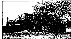
GREAT FAMILY HOME in very desirable award winning Doherty school area. Spacious kitchen and family room with fireplace. Four bedrooms, 2 1/2 baths. Central air, tennis courts. Don't wait it won't last! $169,900 (851-5500) 48322