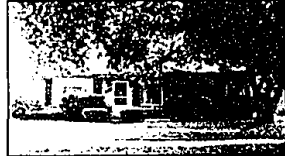
DELIGHTFUL OPEN THREE BEDROOM RANCH in desirable North Royal Oak. Third bedroom could be a den. Large kitchen with eating area. Knotty pine rec room. Beautifully maintained. $122,900 (644-6300) 429756