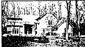
UPPER STRAITS LAKE PRIVILEGES, a pond, and nearly an acre of woods come with this custom built 4 bedroom home. Library, family room, kitchen with island. Workout room, sauna and shower in lower level. (644-6300) 422023