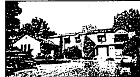
SPACIOUS TRANSITIONAL HOME. Bridge overlooking great room with vaulted ceiling, ceramic tile foyer, newer central air. Professionally finished lower level. Enclosed hot tub room with vapor seat. $445,000 (851-5500)