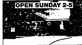
CHARMING FULL BRICK RANCH. Hardwood floors, cove ceilings, natural fireplace with gas logs. Den, Florida room. Basement rec room. $34,900 18749 Sunnybrook, Lathrup Village, N. of Eleven, W. of Southfield (689-7300) 424684