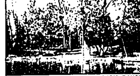
DRAMATIC FOUR BEDROOM CUSTOM RANCH with breathtaking views of pond. Wrap around deck accessed from dining room, living room, master bedroom. Soaring fieldstone fireplace in living room. $439,000 (644-6300) 429965