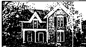
HISTORICALLY DESIGNATED FOUR BEDROOM colonial, circa 1870, in downtown Historic District of Birmingham. Preserved and updated befitting the period of the home. Florida room, library. $369,000 (644-6300) 428807