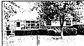
VACATION AT HOME with an 18x32 automatic in-ground pool. Large deck and sun porch. Three bedrooms, fireplace in living room. Two car garage with 9x22 work room, could be pool dressing area. $126,000 (644-6300) 429754