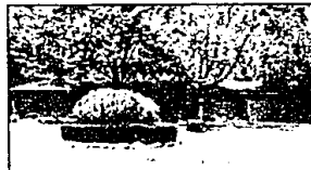
A FOUR BEDROOM, 3 BATH RANCH for quality seekers in Bloomfield. Fine and very detailed renovation inside and out. Gourmet kitchen, family room, recreation room. Gorgeous pool setting. $389,000 (644-6300) 430462