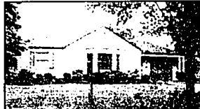
BIRMINGHAM TWO BEDROOM CHARMER. Large living room with hardwood floors, built-in cabinets and gorgeous fireplace and mantle. Separate dining room with French doors to screened porch. $211,000 (644-6300) 429978