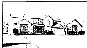
TREMENDOUS VALUE in this large great room colonial located in Aron Hollow. Four large bedrooms, 2 1/2 baths and 1st floor laundry room all on a beautiful private lot close to 1/2 acre. Rochester $219,900 (651-3500) 420353