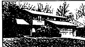
VALLEY STREAM SUBDIVISION! This custom designed two story home has 4 bedrooms, 2 1/2 baths. The well planned floor plan includes 1st floor laundry room and family room. Great deck and patio. Rochester $209,000 (851-3500) 426484