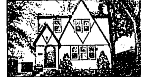
TERRIFIC NORTH ROYAL OAK TUDOR in move-in condition. Three bedrooms, updated kitchen and bath. Cove ceilings, archways, and charm! Fireplace and built-ins in living room. Fenced backyard with deck. $134,900 (644-6300) 429753