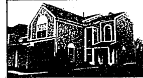
FIRST FLOOR RANCH CONDO backing to #2 green on Heather golf course. Two bedrooms, 2 baths, marble gas log fireplace, upgraded cabinets, mirrored doors. French doors to second bedroom or den. $182,000 (644-6300) 422024