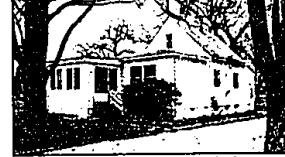
GREAT STARTER OR RENTAL. 3-4 bedrooms on large country lot. New paint and carpet '93. Updated kitchen and bath. Newer roof, furnace, water heater. Copper plumbing. Land contract terms. $84,900 (689-7300) 408545