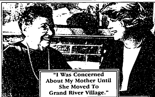
"I Was Concerned About My Mother Until She Moved To Grand River Village."

Farmington firefighters responded after someone reported smelling smoke at Kensington Manor Apartments on Farmington Road around 7:30 p.m. June 13. The odor was coming from a furnace, which was shut off.