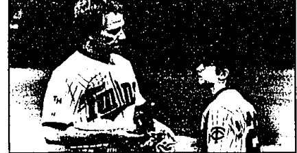
Learning from the kid: Lou Collins (Timothy Busfield) discusses baseball strategy with 12-year-old manager-owner of the Minnesota Twins, Billy Heywood (Luke Edwards) in Castle Rock Entertainment's "Little Big League" coming to theaters this week.