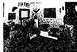
David Good Antiques Camden, OH