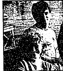
research engineer. A September wedding is planned.

Her fiancé is a graduate of Farmington High School and the University of Michigan with a degree in mechanical engineering. He is employed by Battelle Research in Columbus, Ohio, as a